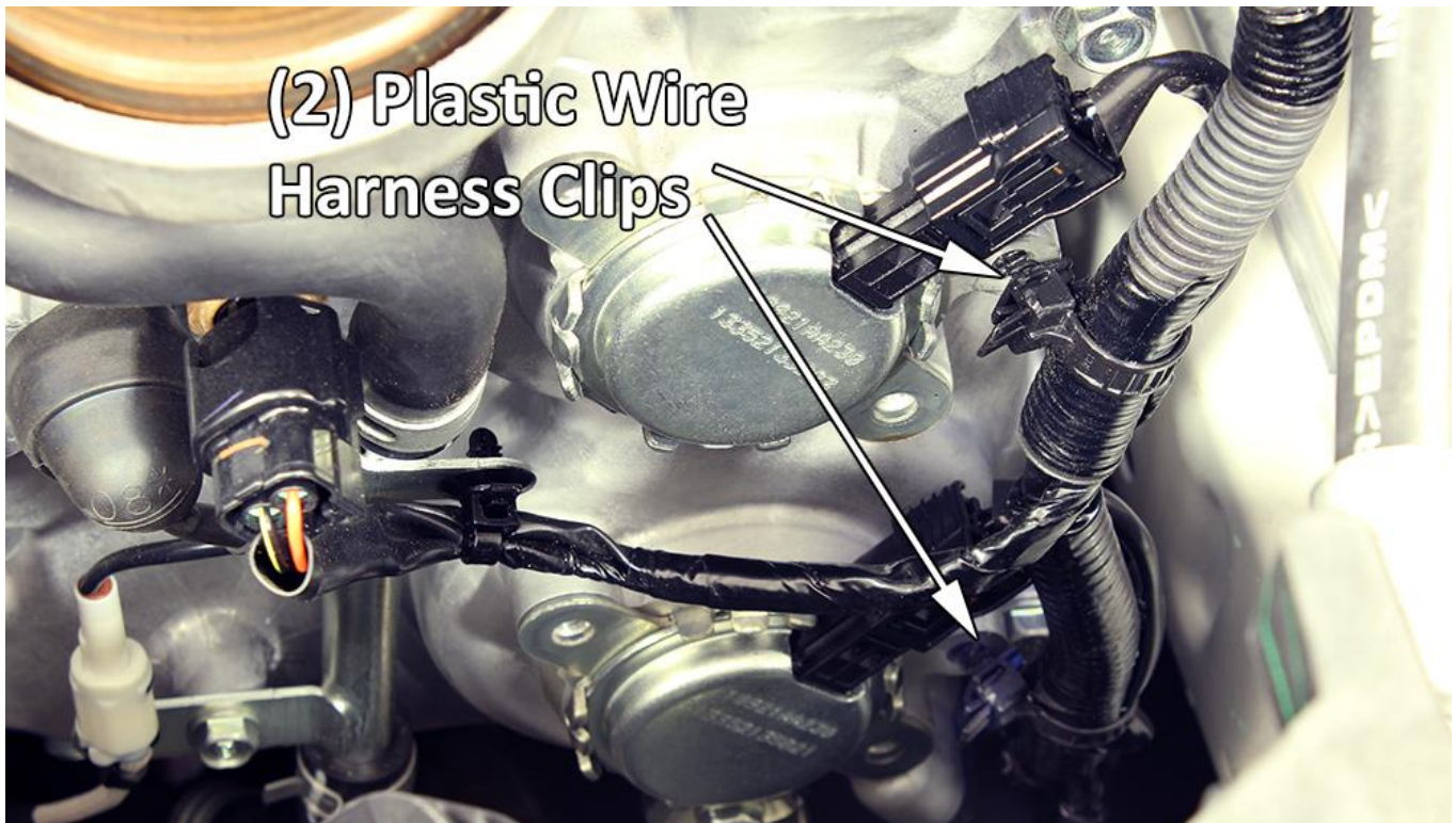
Left side of engine shown above.